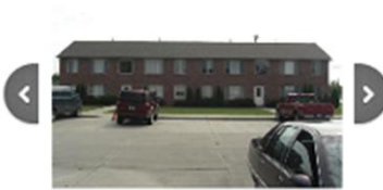
Item 1 of 12 6 Images / 6 Sketches

Parcel Number: 02-011-2000-000 Location ID: K129-006800-00A8-01